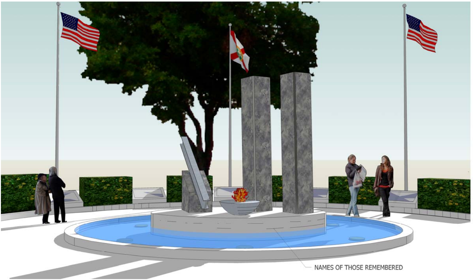
NAMES OF THOSE REMEMBERED

Palm Harbor Fire Rescue is entering the building phase for the 9/11 Memorial to honor the 343 FDNY firefighters that lost their lives in the World Trade Center on September 11, 2001. This amazing Memorial will be located at Curlew Hills Memorial Gardens, our generous community partner. Your donation of $100 or more will honor these fallen heroes with an inscription of their name(s) in granite, surrounded by a WTC steel beam, two granite towers and an eternal flame. You may request to honor a specific firefighter or allow us to choose one for you. Complete FDNY Fire Companies may also be requested.* As a donor, you will receive an engraved bracelet, a photo and information on each sponsored hero. Your name will be listed on our Plaque of Appreciation at Fire Station 65. We appreciate your generous support of the 9/11 Memorial!